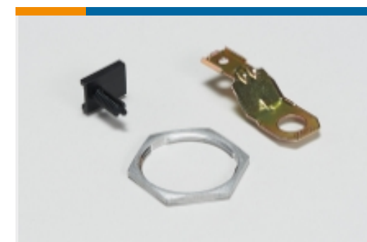
Other Automotive Connector Accessories(13)