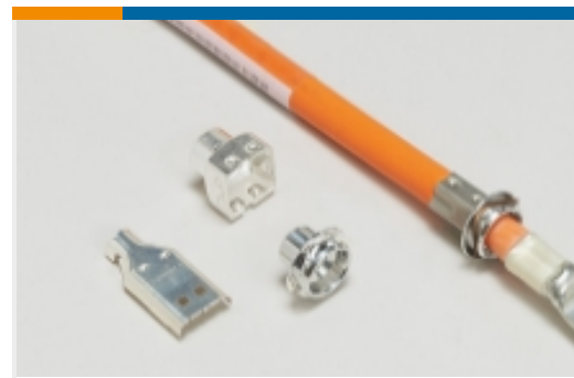
Automotive Connector EMC Shielding (2)